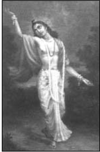
Śrī Chaitanya Mahāprabhu

How this is so can be understood by the analogy of a drama. In a drama in the theater, an actor may play the part of a dead man. As his body is being carried, he can't say anything; he can't move. That does not mean that he is dead. Similarly, a devotee in śānta-rasa may assume a passive role as a creeper, a shrub, or a tree in Vṛndāvana, in order to enhance the drama of Rādhā-Govinda līlā .