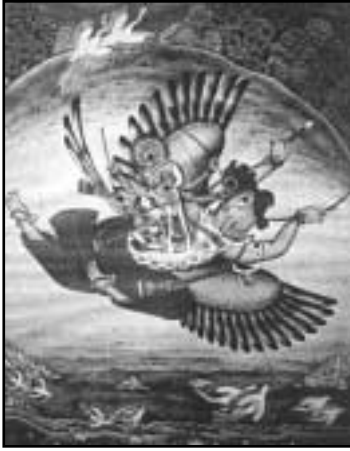
Garuḍa the carrier of Viṣṇu

carried the eggs away. When the ocean stole her eggs, the bird became angry and asked for them back, but the ocean would not return them. The bird went to her master, that bird went to his master, and in this way they finally went to Garuḍa, the master of all birds. Garuḍa is the servant bird-carrier of Viṣṇu. And