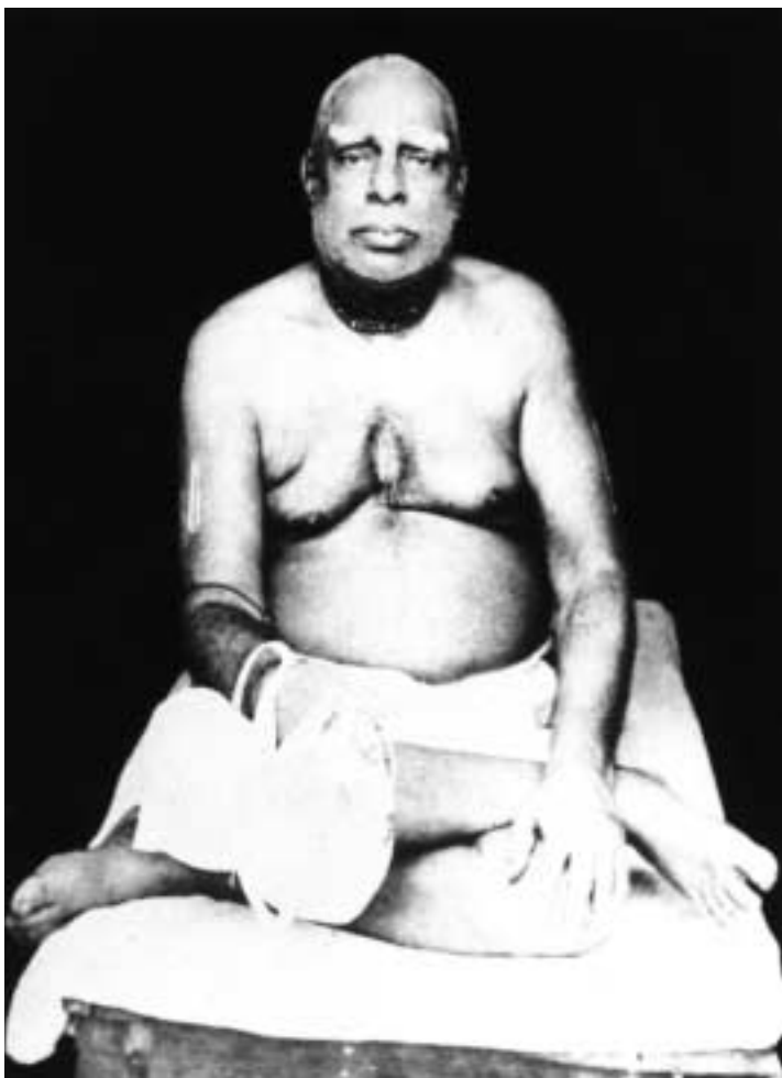
Śrīla Bhaktivinoda Ṭhākura