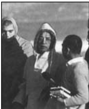
Śrīla Bhaktivedānta Swāmī Mahārāj

No. Realization of spiritual reality is independent of all material contamination or misconception. That injection into our soul is given by Vaikuṅṭha, by the eternal associates of Viṣṇu. Perceiving spiritual reality is the function of