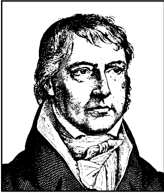
George Wilhelm Friedrich Hegel

die as you are. Your ego must be dissolved and then the real inner or finer self will come out. This is a good philosophy to have appeared amongst the Westerners. The concept of die to live comes in the line of Vaiṣṇavism. Hegel has also said that the Absolute is “by Himself” and “for Himself.”