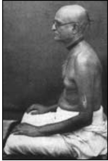
Śrīla Bhaktisiddhānta Sarasvatī Ṭhākura

Everything is conscious. And when we realize it fully, we shall be fixed in the svarūpa-śakti domain in the spiritual world. There, the different living beings may pose as matter, as the Yamunā, as water, as creepers, as trees, but they are all conscious units, simply posing in different ways.