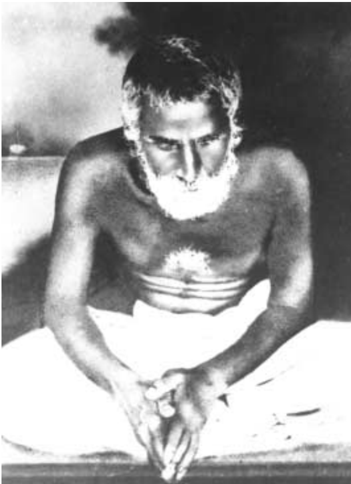
Śrīla Gaura Kīṣora Dāsa Bābajī Mahārāj