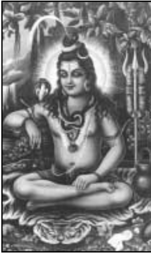
Lord Śiva with Gaṅgamāyī (the Ganges) on his head.

are also represented in the Vedāntic aphorism tat tvam asi : Thou art that. Tat or “that” is there and tvam “you” is also there. Both variety and unity are found represented in the aphorism tat tvam asi , but Śaṅkarāchārya accepts one and rejects the other. His explanation is therefore a misinterpretation of the original meaning of the Vedānta-sūtras . It is not a proper interpretation of the Vedas , because he has thrust his own idea or conception forward in the name of the