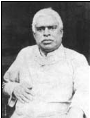
Śrīla Bhaktivinoda Ṭhākura

What Bhaktivinoda Ṭhākura saw in his mind must exist somewhere in this world, sometime in the future, or sometime in the past. That very thing he describes in an apparently fictional way actually existed. Let me give you an example. When I speak, the sound moves at