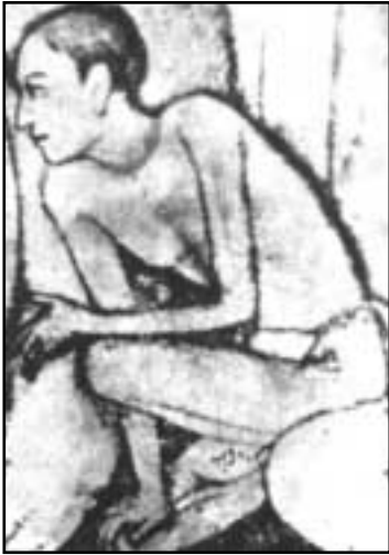
Śrīla Rupa Goswāmī

aspect of devotion will gradually come out. And we shall be able to dive deep into reality. As we give up the external covers, and we experience what may be considered as death in the external world – die to live – we shall enter into the inner side more and more.